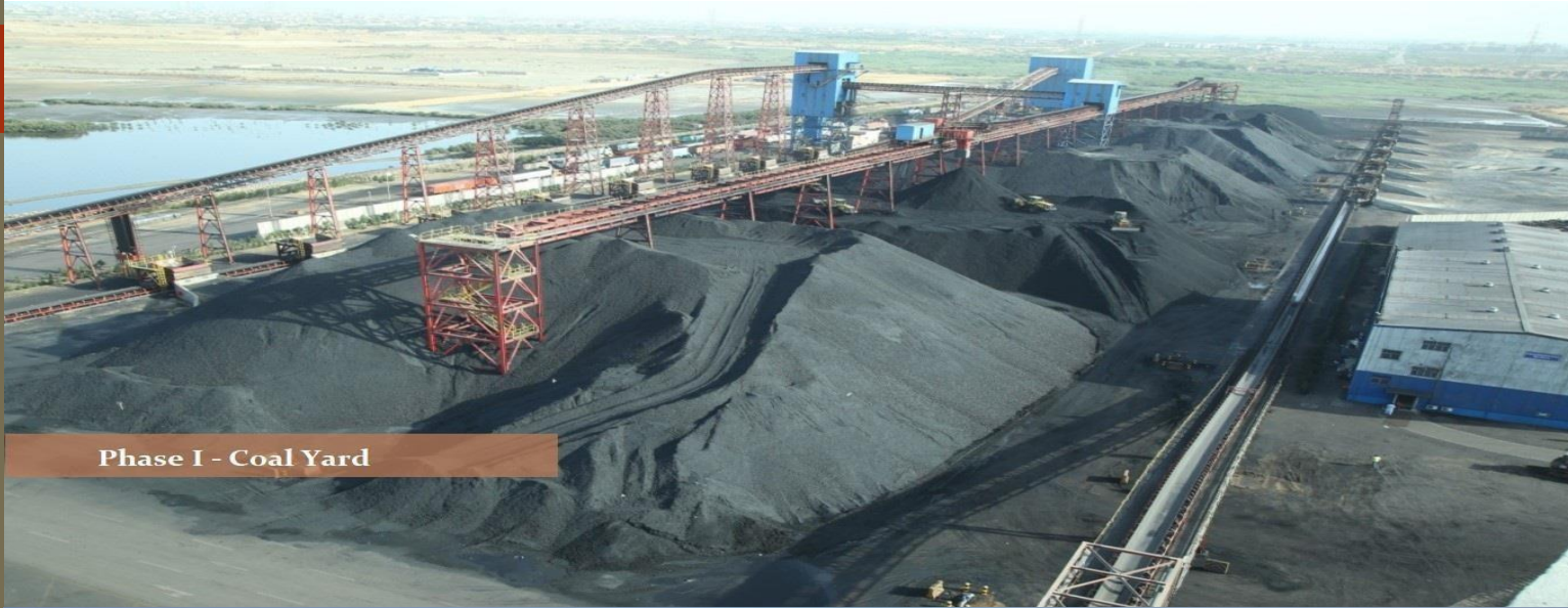
Phase I - Coal Yard

Successful Completion of South African Coal Shipment of QTY 60,044 MT Vessel – Great Fortune